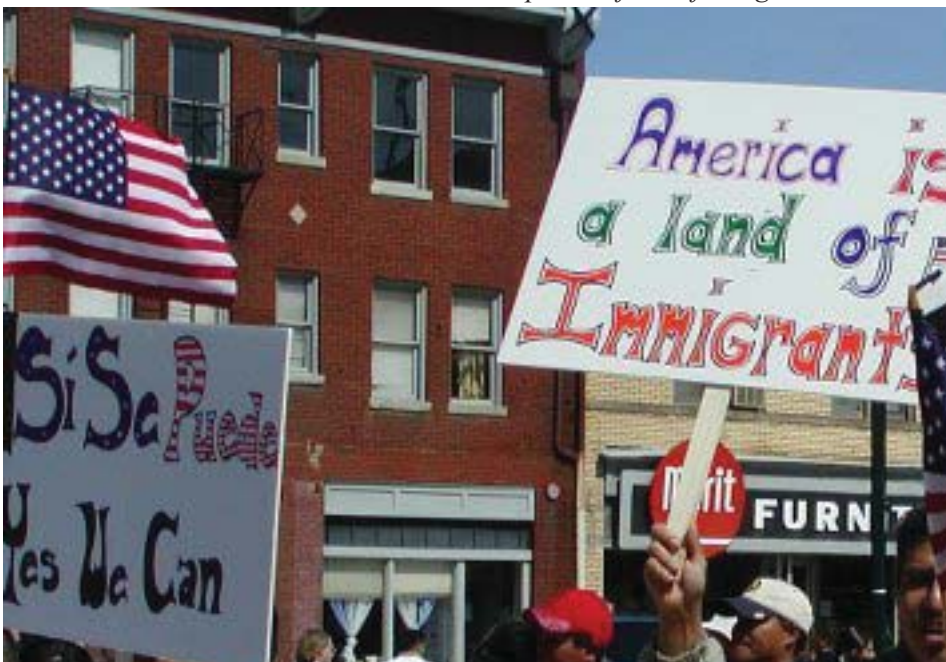
KFTC hosts a pro-immigration rally near the Fayette County courthouse.