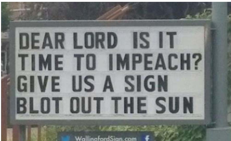
A sign that was spotted at the time of the total eclipse, Aug. 21.