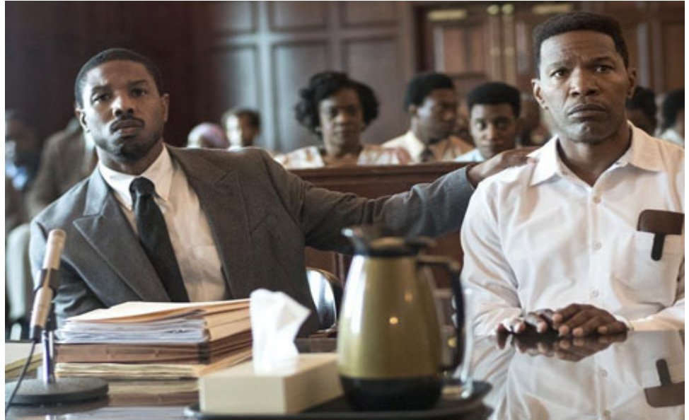
Michael B. Jordan, Jamie Foxx in Just Mercy .

You've read the dismal stories before, dreading the endings as you devour the details. Racist deputies, willfully blind judges and jailers, lying witnesses, and winked-at circumventions of legal safeguards — they're all here. The stink of corrupt Southern justice is pungent; legal