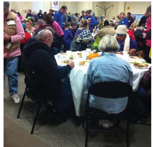
The fellowship at the Catholic Action Center Thanksgiving feast will be different in 2020, but meals will be served in to-go boxes.