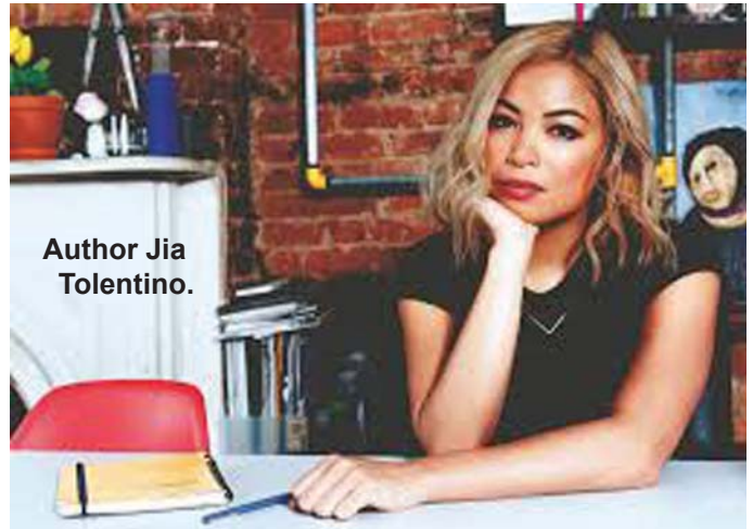
Author Jia Tolentino.

The other deep essay among the nine in this collection makes the point that the beauty-ideal