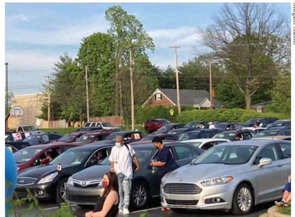
The 2021 Nehemiah Action was a drive-up event at Mary Queen of the Holy Rosary Church.